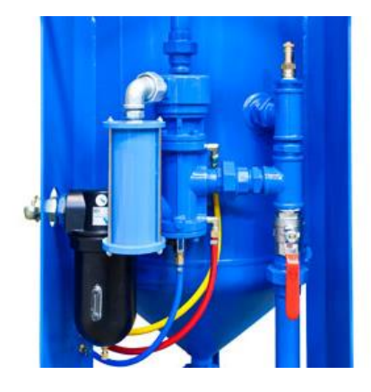
Rear AH-20/24 Pot showing remote control system, and water trap